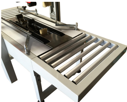
Infeed & Exit Conveyors Included